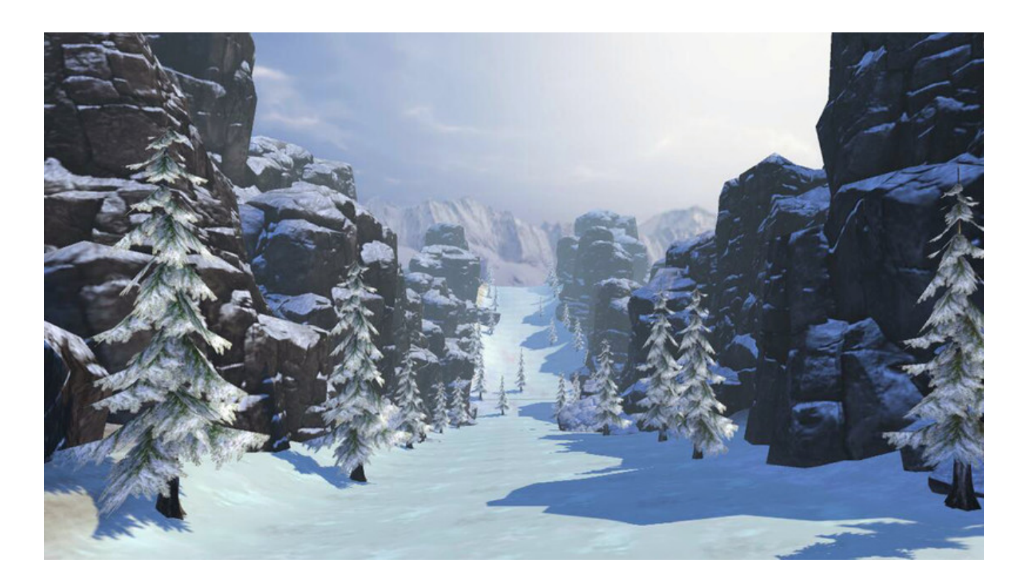
Download ->->-> http://bit.lv/2SOI6Bp

TS Marketplace: Union Pacific Scenario Pack 02 Add-On Trainer Download